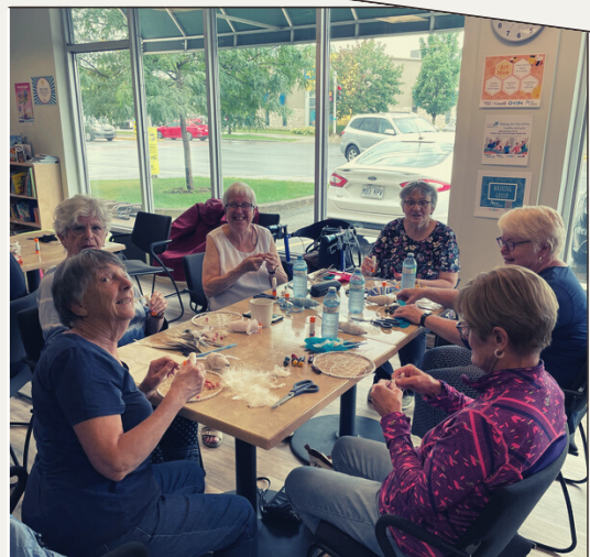
Dream Catcher Workshop September 2022