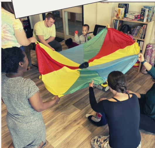
Sprouts August 2022