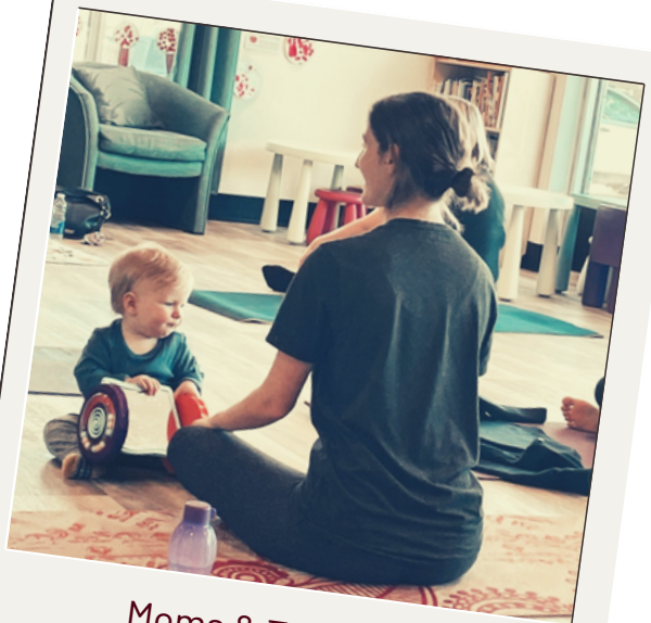
Moms & Tots Yoga October 2022