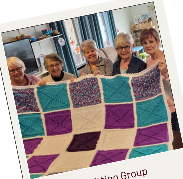
Knitting Group March 2023

It has been one year since our Community Space has been up and running and it has been busy! From seniors' art activities to moms and tots yoga to weekly staff meetings, there is something for everyone all week long. Check out some of the highlights from the past year below!